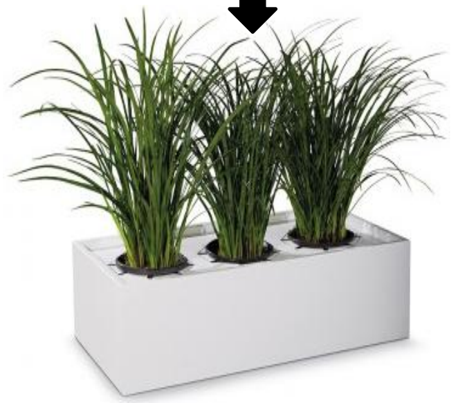
TD-PB2(no holes on

VMS has more items for your consideration, pls contact us directly for more customized solutions.